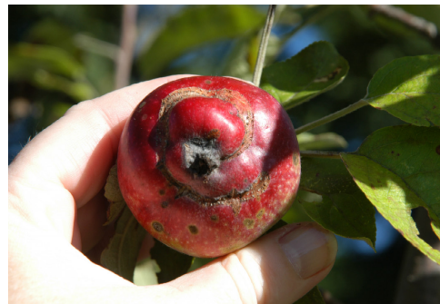
European Apple Sawfly Damage