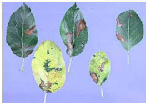
Necrotic leaf blotch on Golden Delicious apple leaves.

Yellowing of Golden Delicious Leaves - There is a report out of the Hudson Valley that Golden Delicious leaves are developing necrotic spots, yellowing, and dropping off the trees at an alarming rate. Golden Delicious trees are affected by a disorder called "Necrotic Leaf Blotch." The exact cause of the disorder is not known but it is thought to be physiological. Symptoms are usually most severe when extended cool, rainy periods precedes hot, sunny days. Within an orchard, symptoms can be very variable. If you have Golden Delicious trees and they turn yellow quickly, it may be this disorder. At this point, there is nothing that you can do.