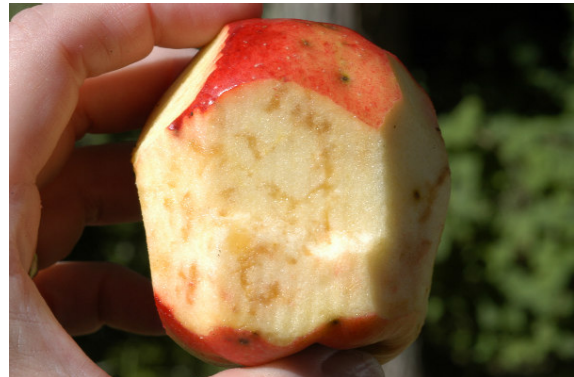
Apple Maggot tunnels throughout apple