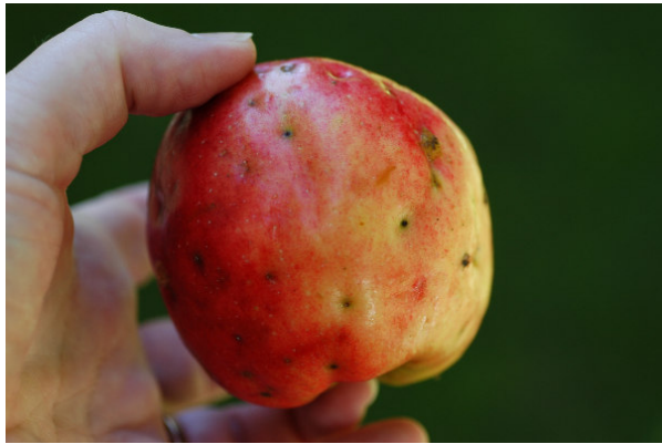
Apple "riddled" by Apple Maggot Fly egg laying