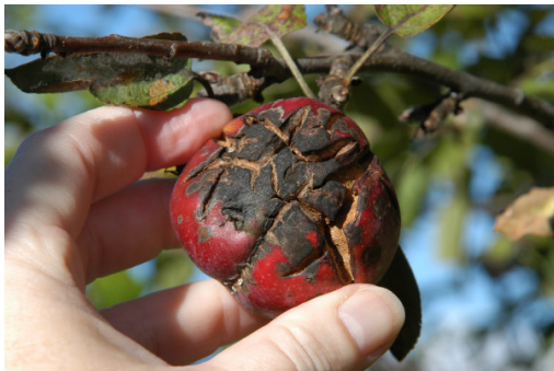
Apple Scab Damage

Walking through the non-sprayed blocks at the UVM Hort. Res. Center (HRC) this morning I saw some ugly apples. It makes you pause and appreciate all the IPM tools we do have to manage the many diseases and insects that can attack apples. The following apples tied for first place for the ugliest apples at the HRC !!