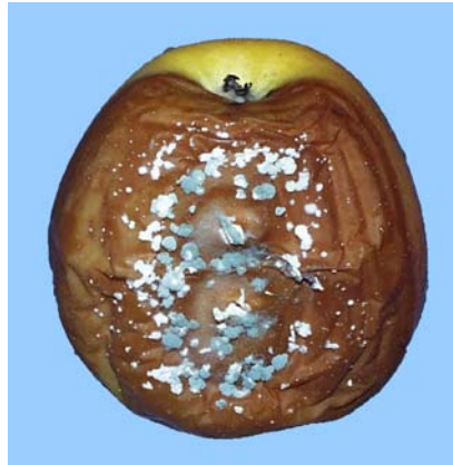
Blue mold caused by Penicillium expansum

3. Keep drench solutions properly recharged: The drench solutions should be regularly recharged according to instructions included on the postharvest labels of the products being used.”